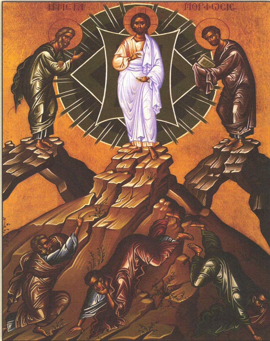
Icon of the Transfiguration of Our Lord