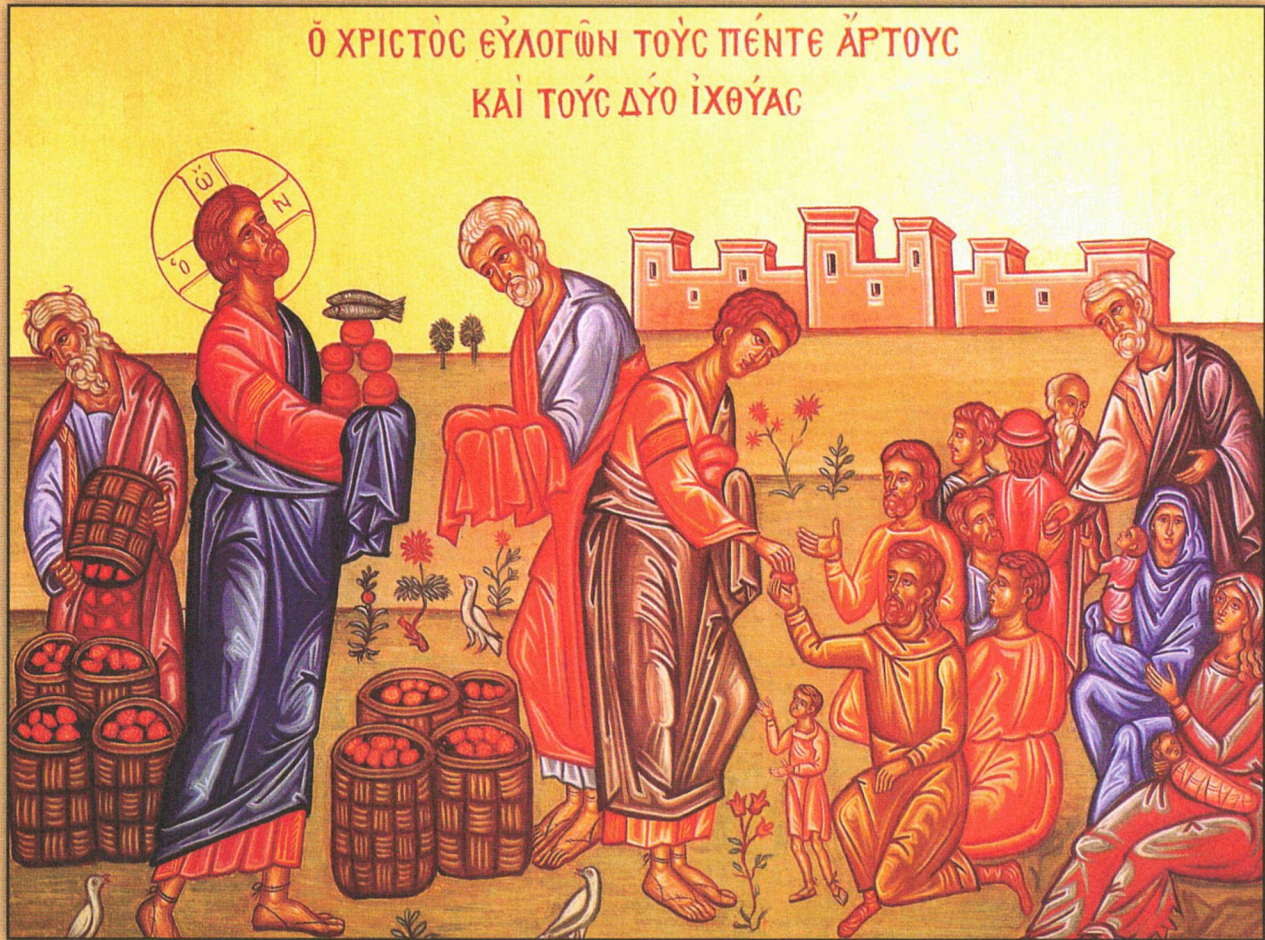
Icon of Jesus Feeding the Five Thousand