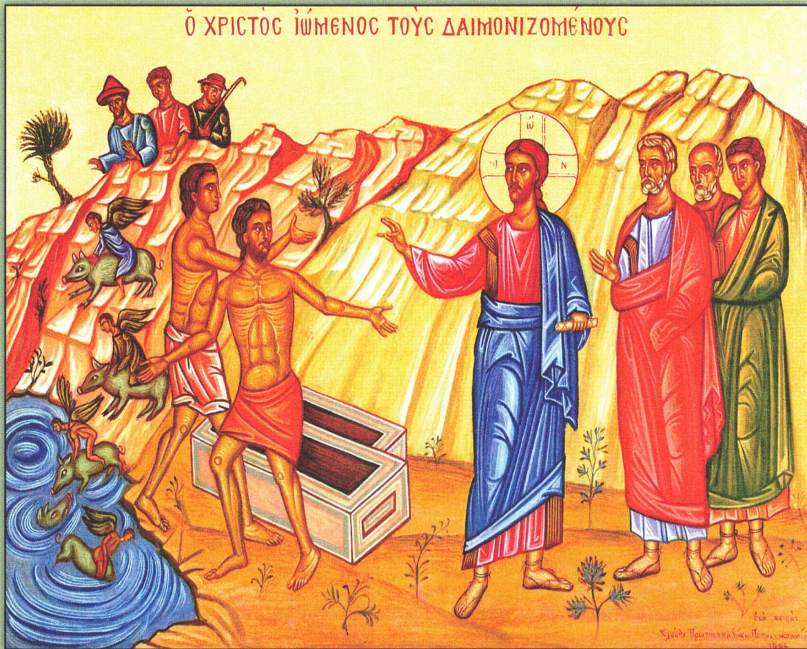
Icon of Christ Healing the Gadarenes