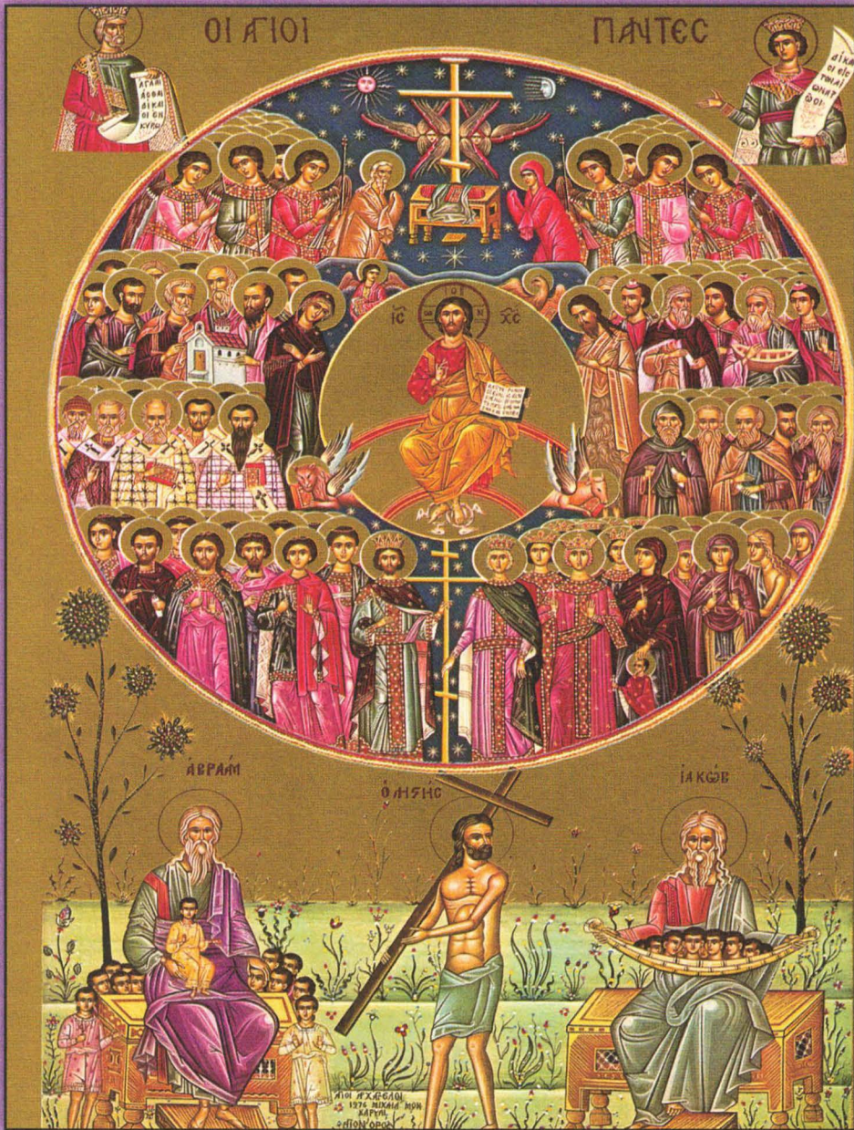
Icon of All Saints