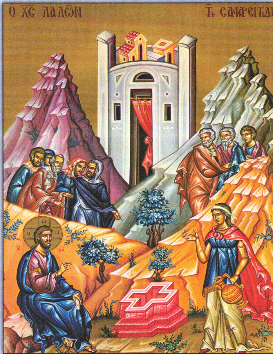
Icon of the Samaritan Woman