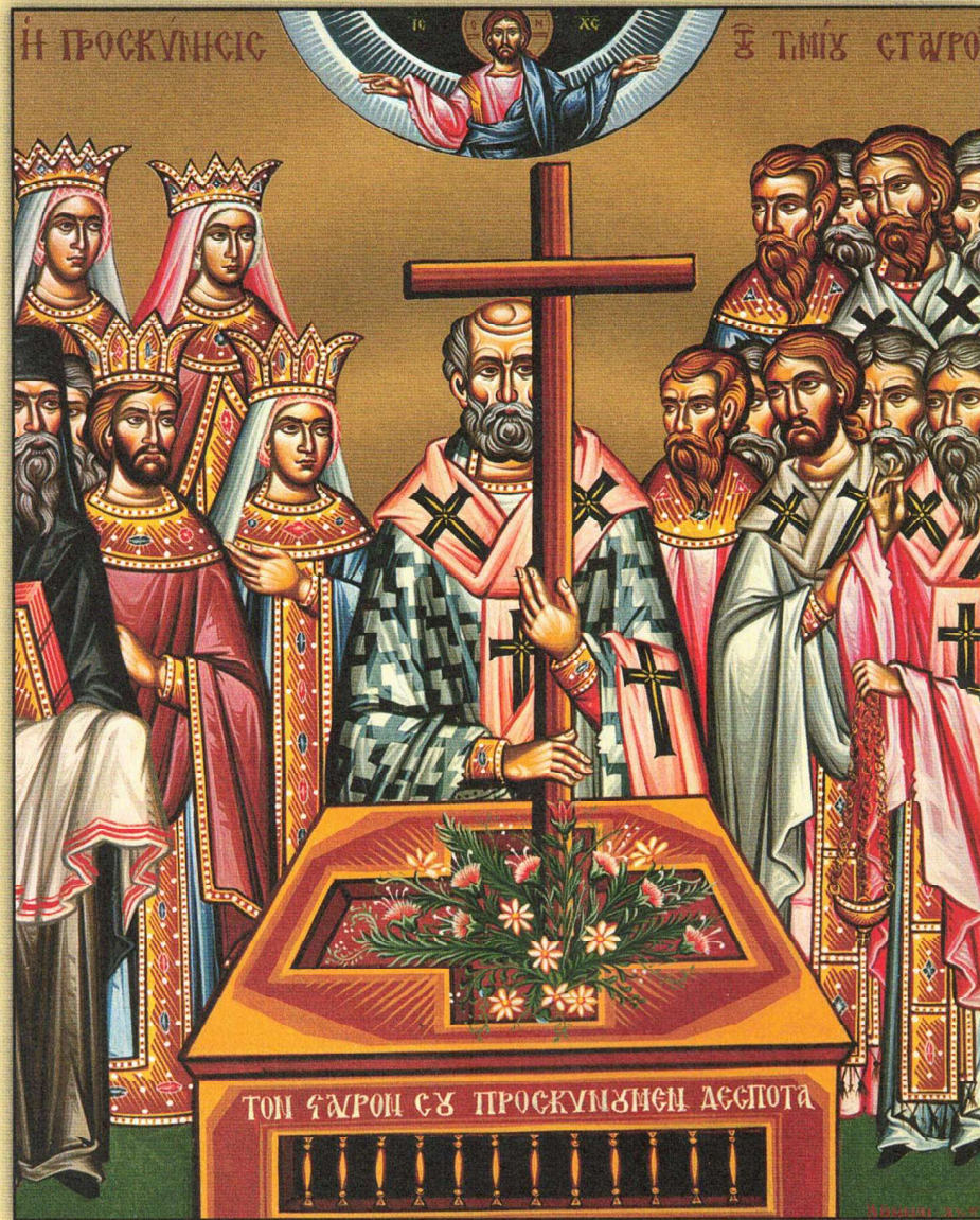
Icon of the Elevation of the Holy Cross