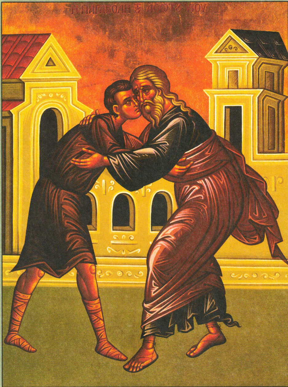
Icon of the Prodigal Son