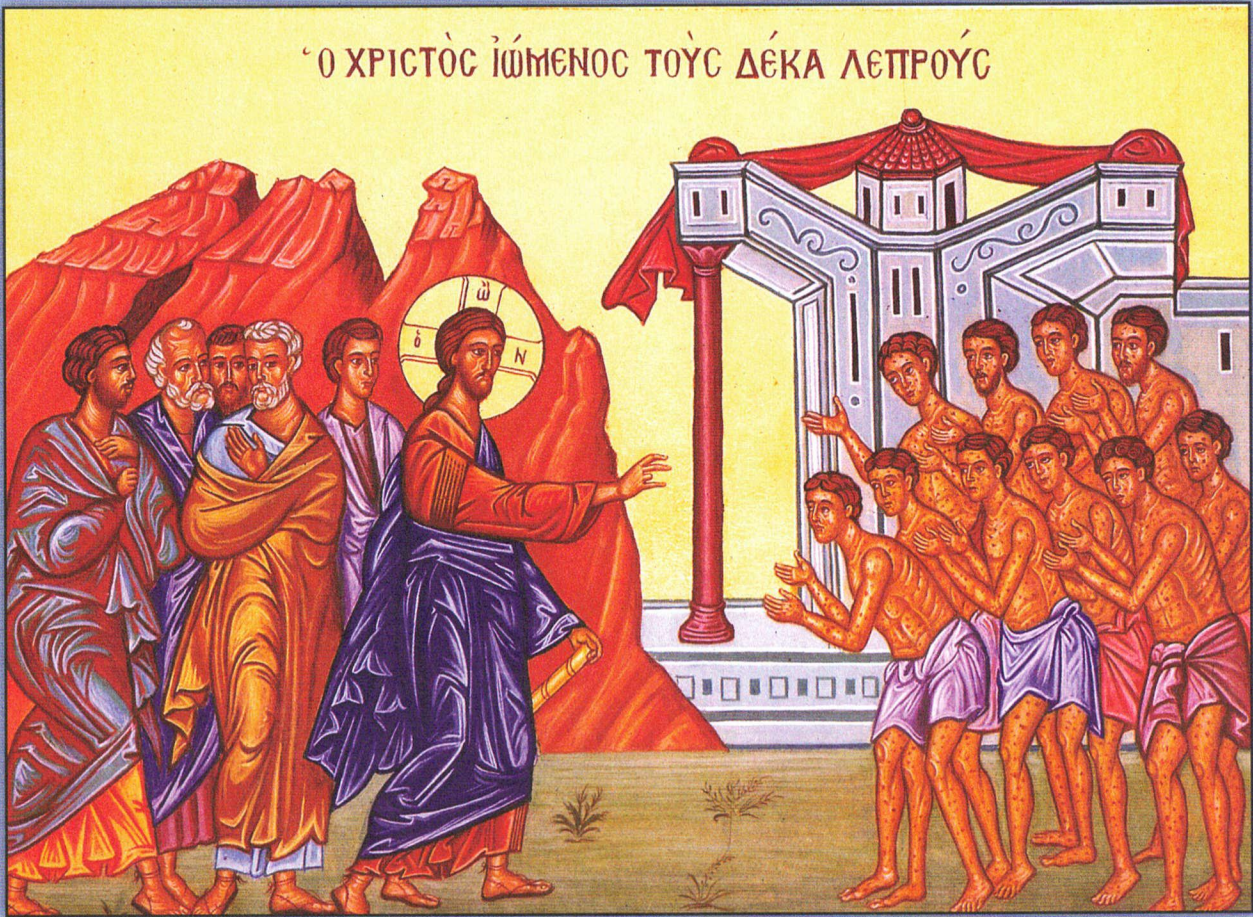
Icon of the Cure of the Ten Lepers – Luke 17:12-19