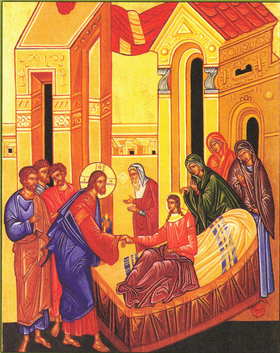
Icon of the Healing of Jarius' Daughter