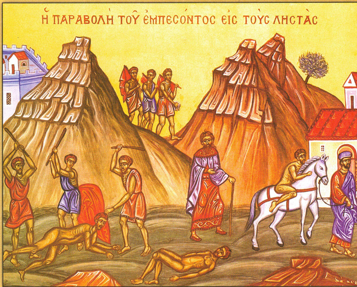
Icon of the Good Samaritan