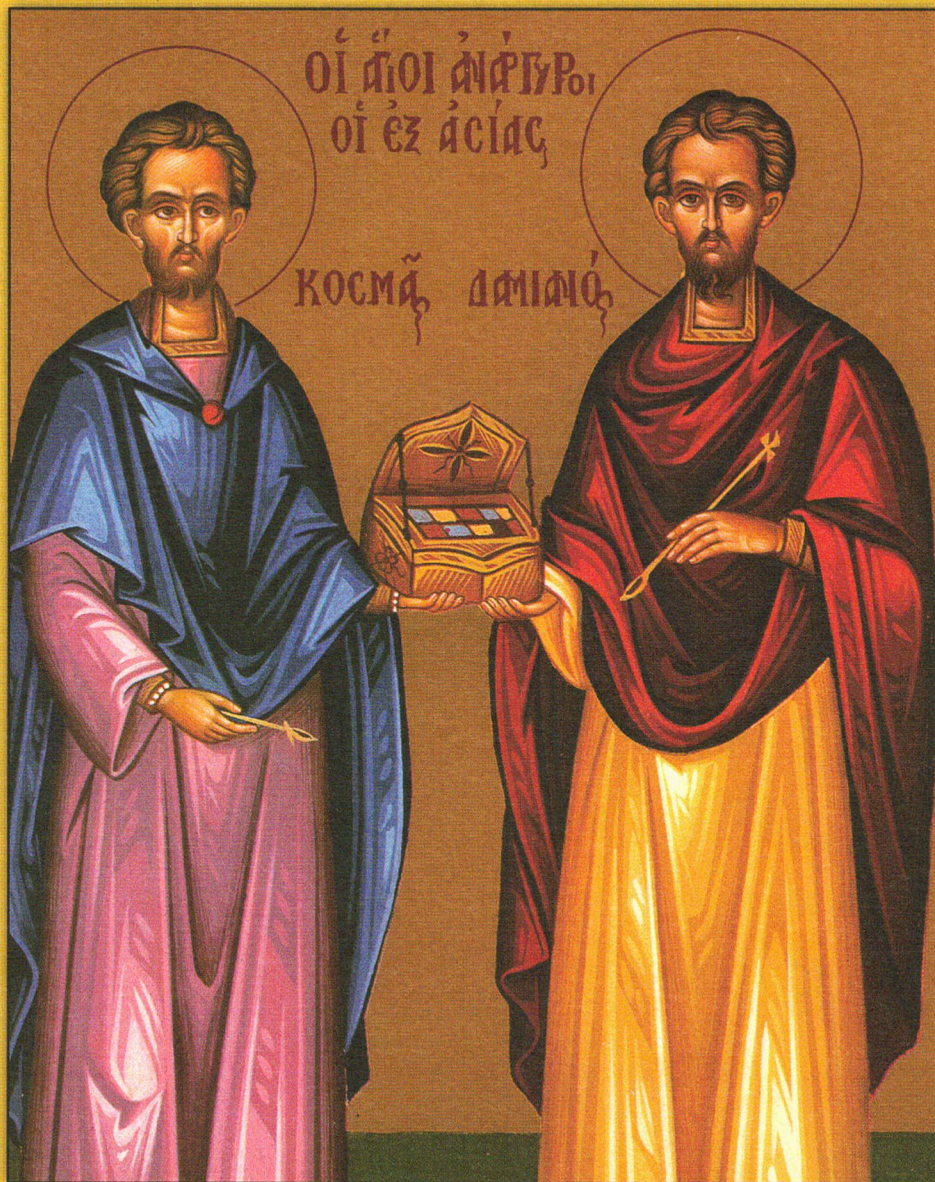
Icon of Saints Cosmas and Damian -- November 1st