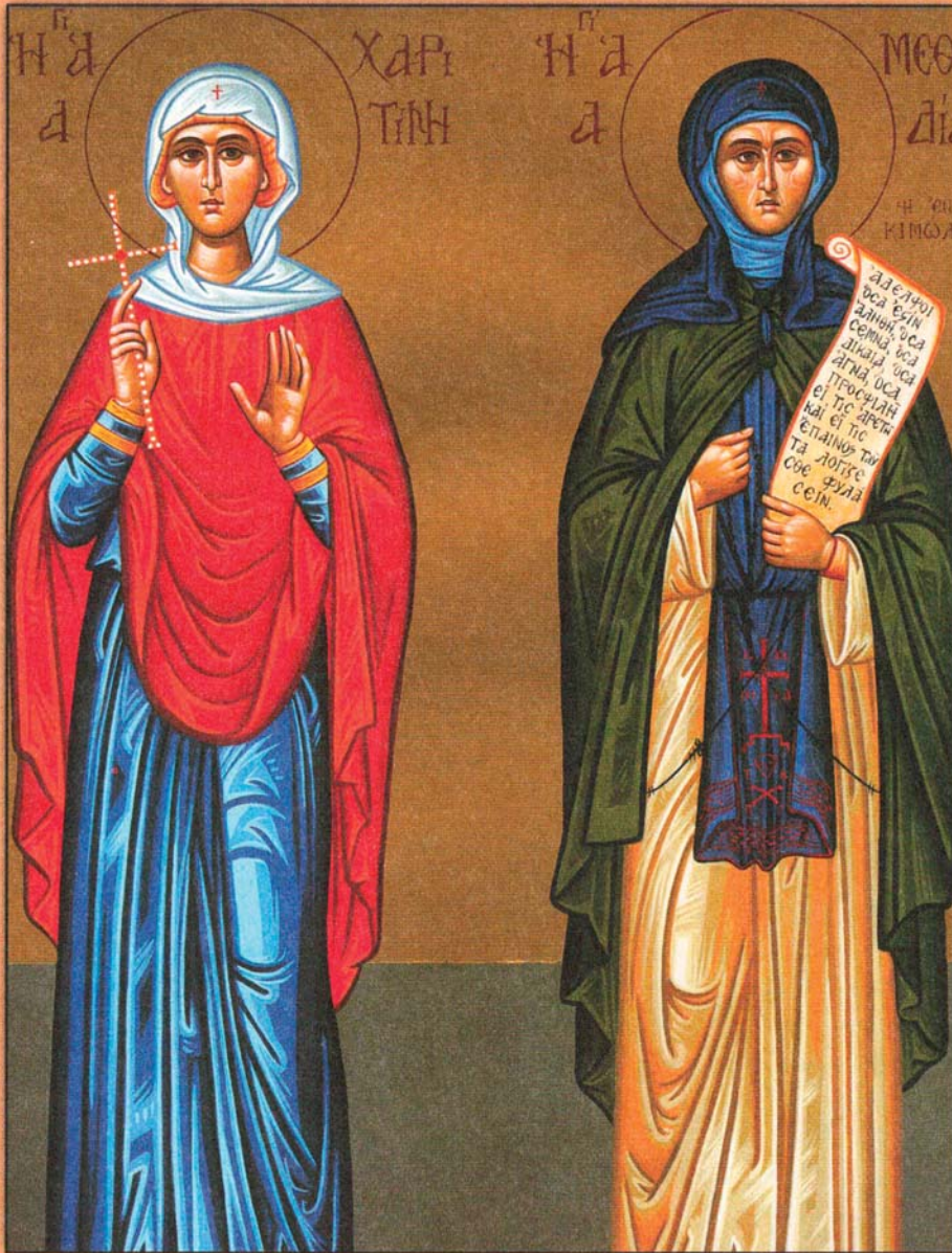
Icon of Saints Charitina and Methodia -- October 5th